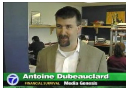
Interview with WXYZ Channel 7.