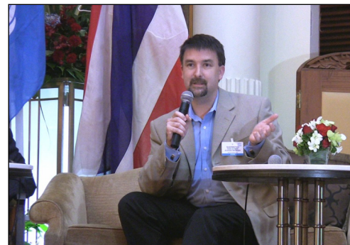
Presenter at the United Nations' Second Global Forum on the Power of Peace in Bangkok, Thailand.